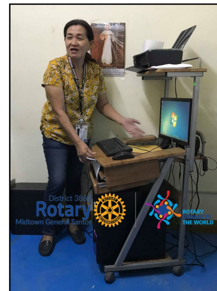
Turnover of office equipment to the Child Protection Unit General Santos City at Dr. Jorge P. Royeca Hospital with Rotary Club Makati Paseo De Roxas.