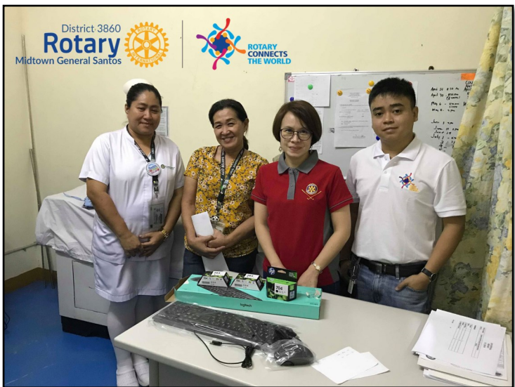
Turnover of office equipment to the Child Protection Unit General Santos City at Dr. Jorge P. Royeca Hospital with Rotary Club Makati Paseo De Roxas.